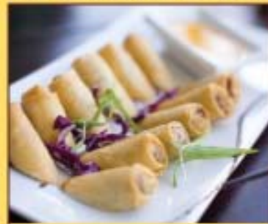
Veggie Spring Roll $1 each