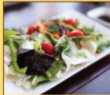
Tray of Mixed Green Salad w/ Ginger Dressing $19.95