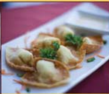
Fried Cream Cheese Wonton 75¢ each