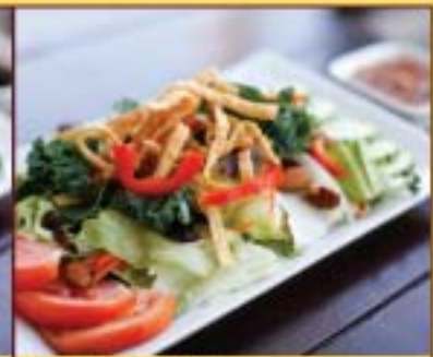
Tray of Classic Salad w/ Peanut Dressing $24.95