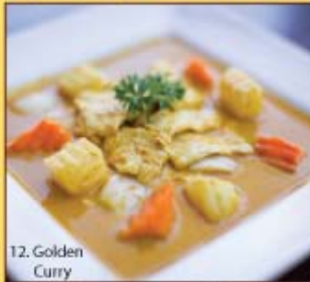
12. Golden Curry