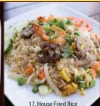
17. House Fried Rice