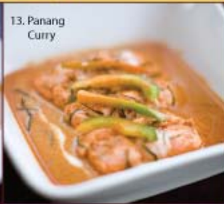
13. Panang Curry