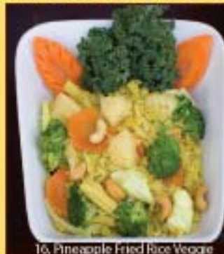
16. Pineapple Fried Rice Veggie