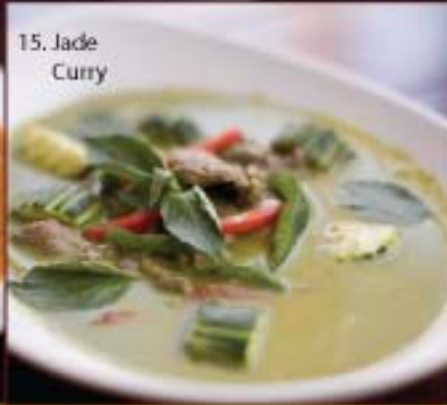
15. Jade Curry